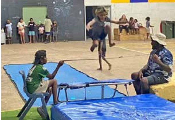
High jump a popular activity in Santa Teresa over the school holidays