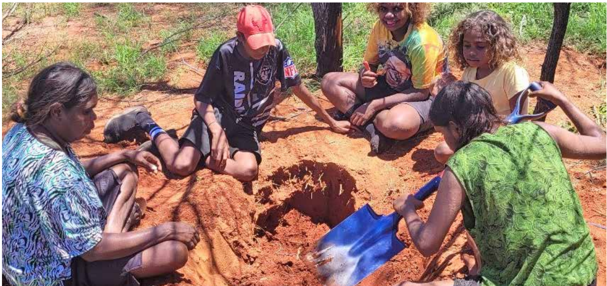
MacYouth Haasts Bluff organised a day trip with the youths and elders tailored to engage the youths in their cultural practices, collecting honey ants and cooking Kangaroo tail.