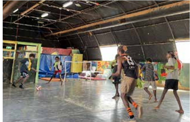
MacYouth Papunya got the score board out during the school holidays and everyone was taking it very seriously. Lots of fun to see staff getting involved and the youth being very engaged