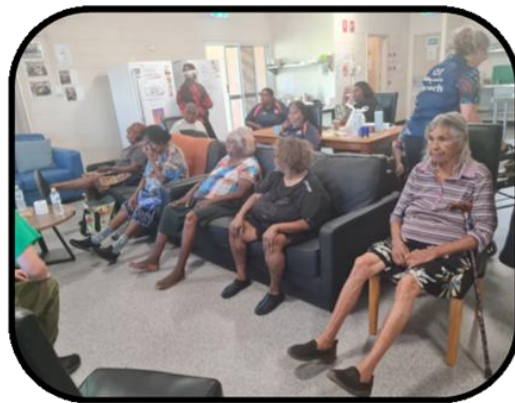
NT Health visit the centre