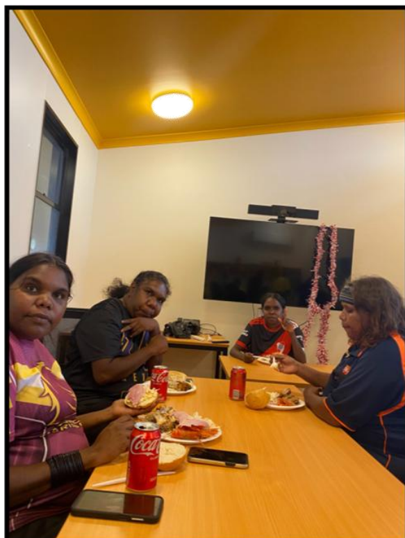
Christmas lunch, at Papunya council office