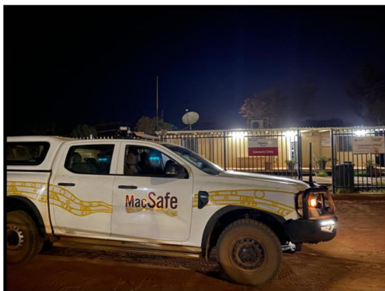
The MacSafe team getting ready for their nightly patrol