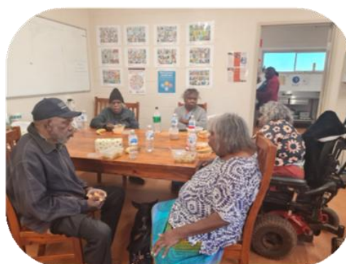
Aged Care clients spending time together at the centre, supporting social connection and wellbeing