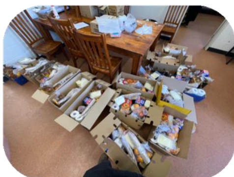
Christmas hampers prepared and distributed by the Aged Care team to support wellbeing and support over the festive break