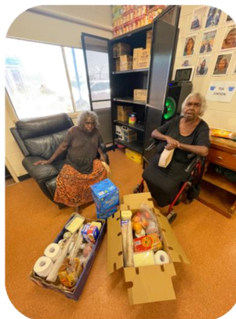
Clients pictured with Christmas hampers