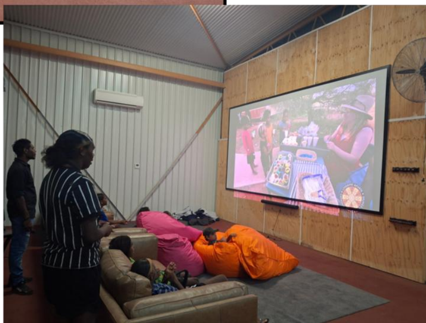
A movie night was held as part of the evening program, offering a comfortable space for young people to unwind together