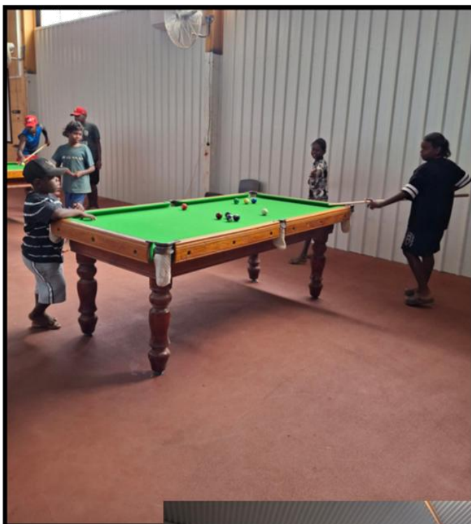
Youth enjoyed playing pool as part of the indoor program, encouraging teamwork and connections