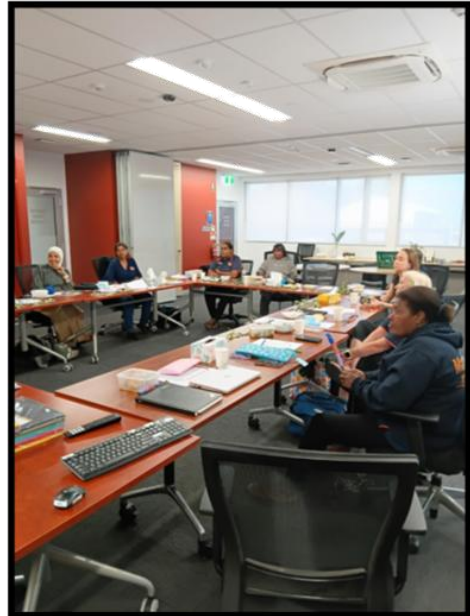
Staff and Team Leaders engaged in professional development training sessions held in the Council Chambers, focusing on collaborative learning and program planning.