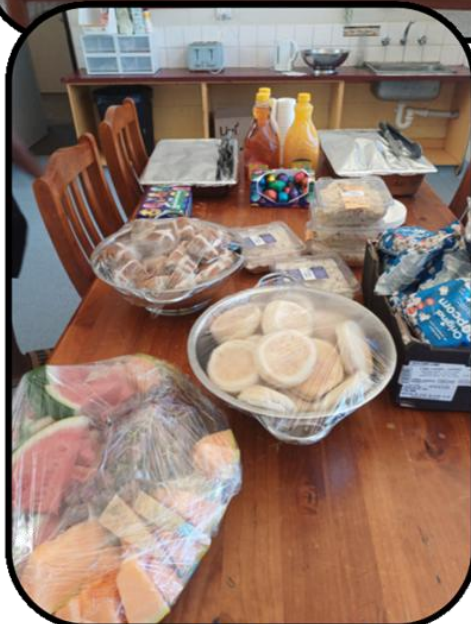
Easter BBQ spread