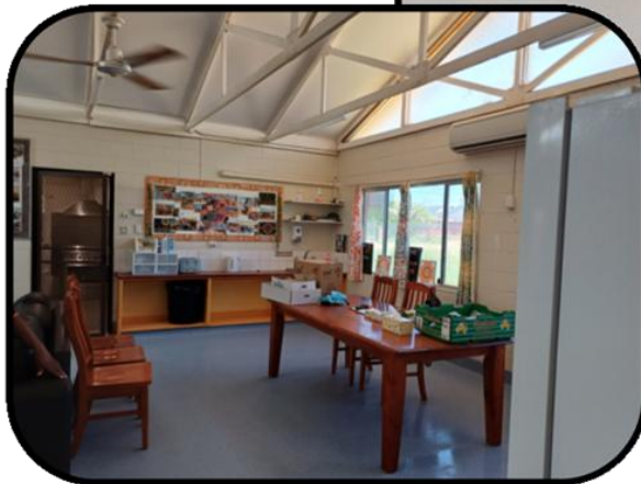
Our Aged Care centre in Titjikala