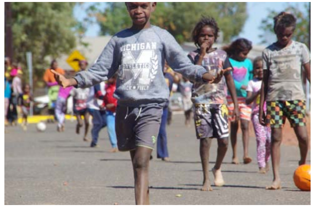
Upcycling from the waste facility has seen old tyres become colourful statues and swings appear from offcut pipes. A regularly emu-bob walk by children and their families maintains Mount Liebig as a clean and healthy community.