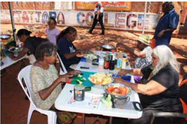
Cooking up a feast. Imanpa residents prepare the food and fire for the cook off competition