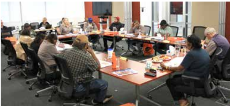
Councillors convene for the October meeting

To submit content, please send an email to the Communications Coordinator at