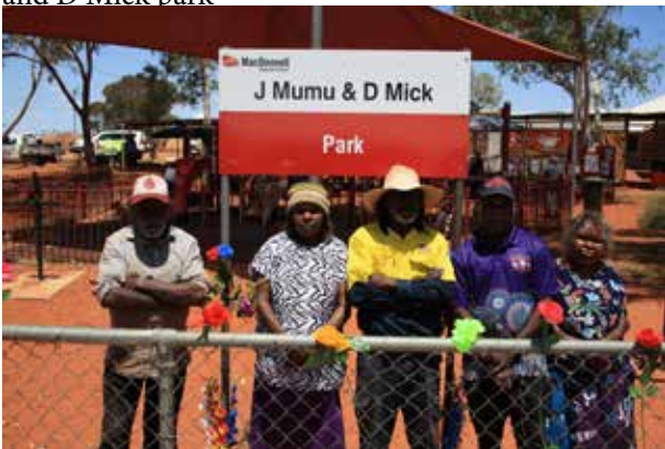
Opening of the new J Mumu and D Mick park