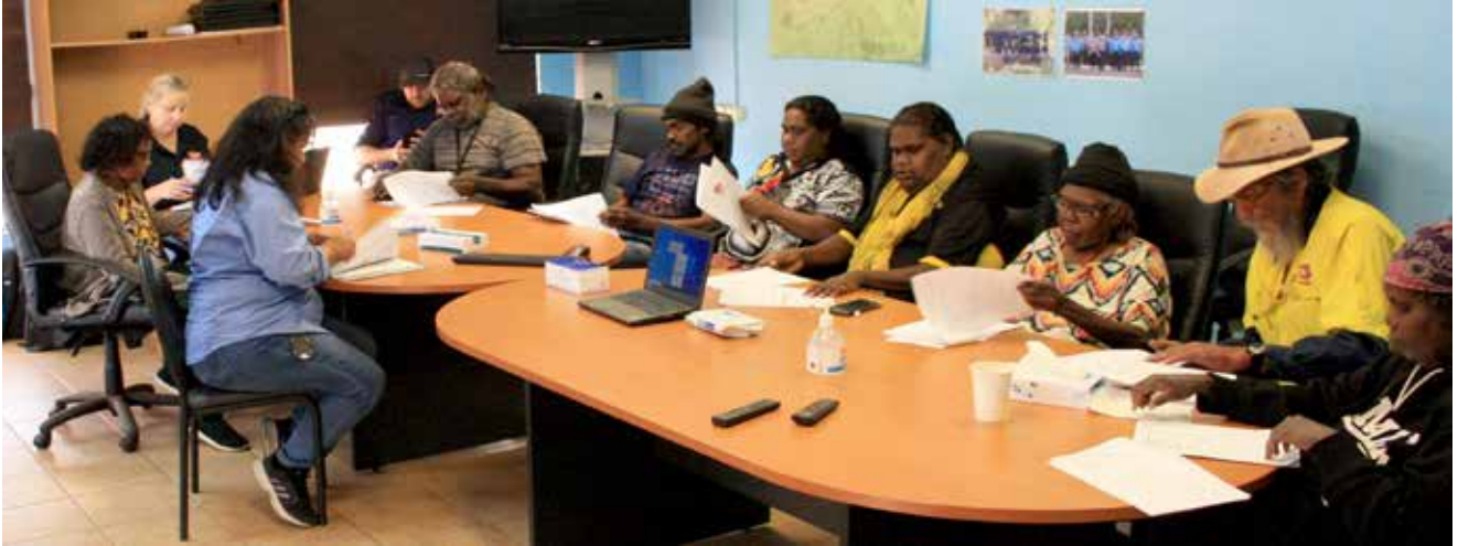
Local Authority members gather for their meeting in November.