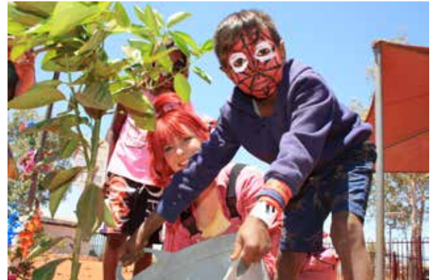
Shrub planting and watering