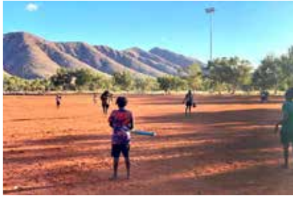
Softball game Docker River(left).